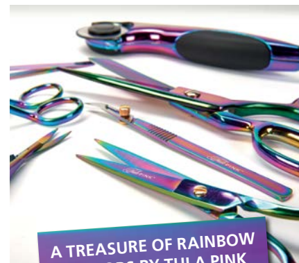
A TREASURE OF RAINBOW SCISSORS BY TULA PINK

We reserve the right to make changes to machine features, equipment and design. Additional information is available at your local BERNINA store.