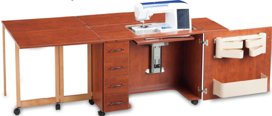
Shown open, with the machine bed the same height as the surface of the cabinet. Optional machine insert should be ordered for your machine's make and model.