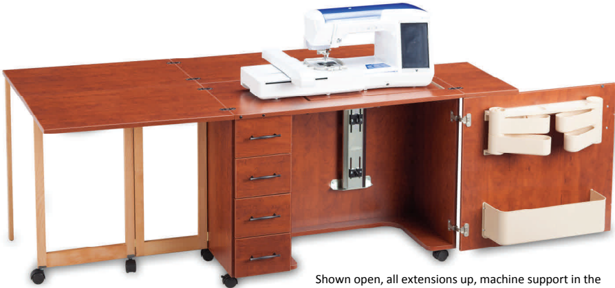
Shown open, all extensions up, machine support in the highest position and able to support a large embroidery machine and its attached embroidery unit.