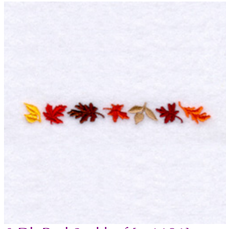
6 Dk Red 2nd leaf [m1181] 7 Orange 1st leaf [m1278]

1 Black House [m1000] 2 Yellow Windows & moon [m1359] 3 Green Grass [m1103] 4 Grey Road [m1163] 5 Black Tree [m1000]