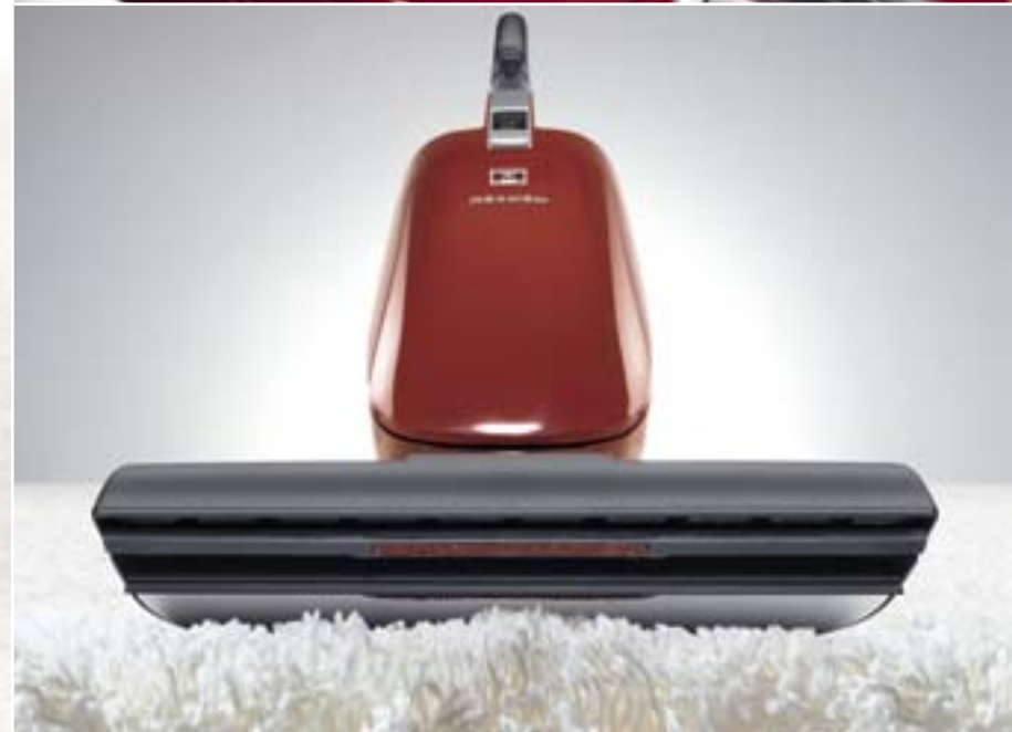
Miele's Universal Upright provides a convenient, effective solution for quick cleaning. For added versatility, suction can be adjusted and the upright can be converted into a handheld vacuum ideal for upholstery, stairs and other tight spaces.