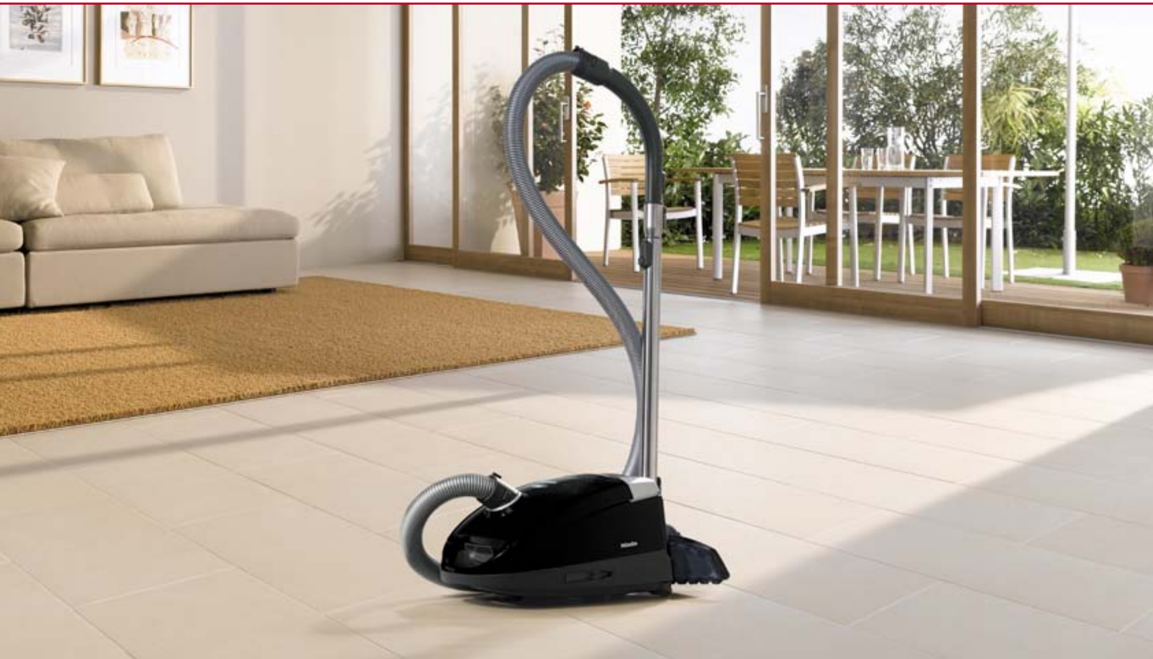
Miele's S6 series blends powerful performance and a compact design.