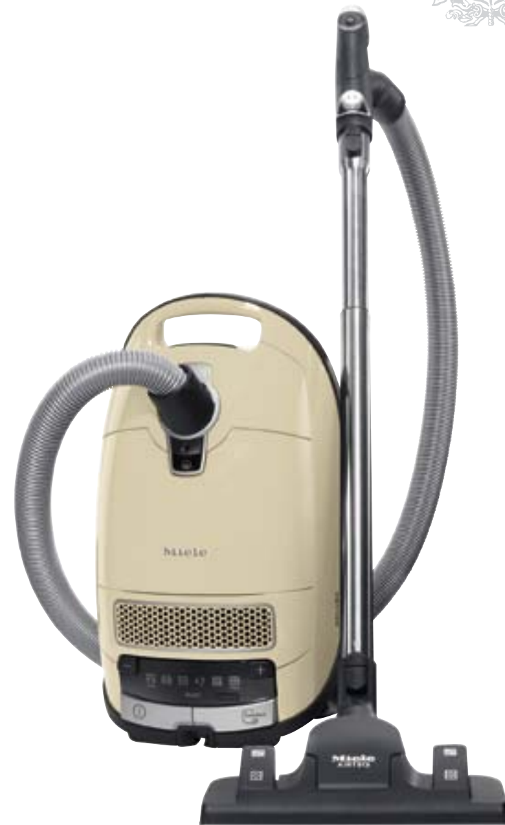
S 8590 Alize

The S8 Alize pairs unique features with eco-consciousness. It also marks the debut of Miele's Dynamic Drive and spotlight handle. With specialized castors for gentle maneuvering over thresholds and uneven flooring surfaces, Dynamic Drive offers soft suspension for the canister. The spotlight handle provides the operator with comfort, while the durable LED light illuminates the area ahead of the floor tool or cleaning accessory to assist with locating and capturing dirt and dust. The Alize includes Miele's AirTeQ floor tool, featuring a streamlined airflow for uninterrupted floor contact. This, coupled with an automatic setting makes the S8 Alize powerful, yet efficient. Balancing precision cleaning with your well-being, the Alize exemplifies Miele's commitment to offering nontoxic materials that are not harmful to your family or to the environment.