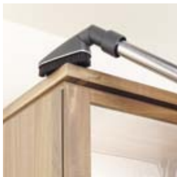
Universal Brush (SUB 20)