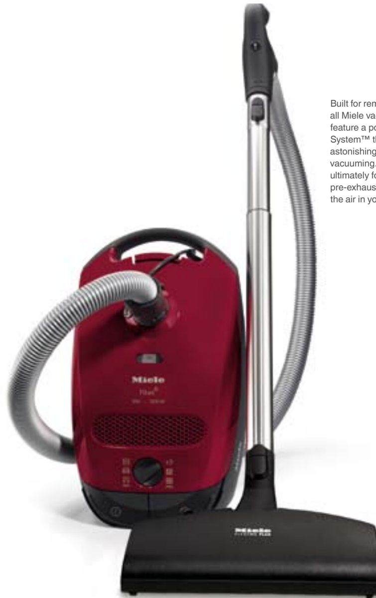
S 2121 Titan

Built for remarkable longevity, all Miele vacuum cleaners feature a powerful Vortex Motor System™ that remains astonishingly quiet while vacuuming. Air is directed, and ultimately forced, through a pre-exhaust filter — purifying the air in your home.