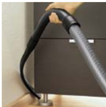
Flexible Crevice Tool (SFD 20)