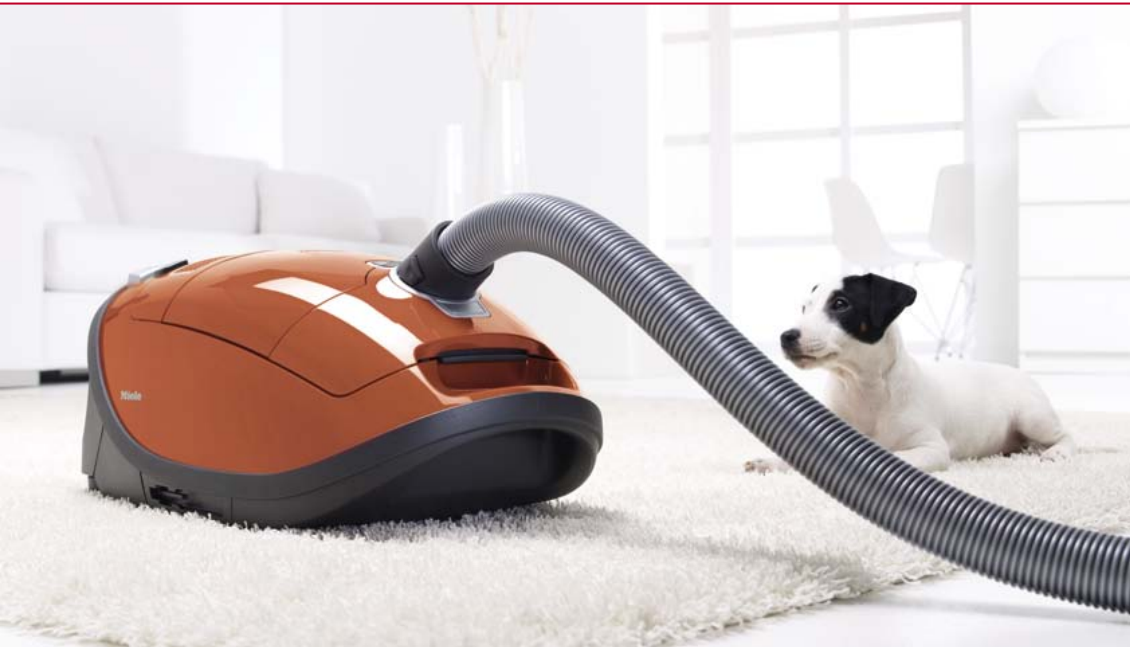
The S8 Cat & Dog vacuum includes a Mini Turbo Brush that removes pet hair quickly and easily.