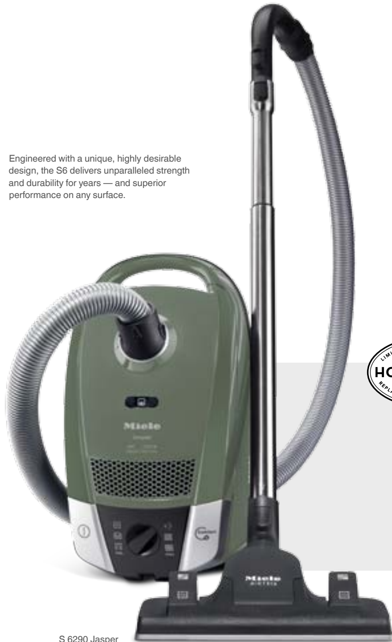
S 6290 Jasper

Engineered with a unique, highly desirable design, the S6 delivers unparalleled strength and durability for years — and superior performance on any surface.