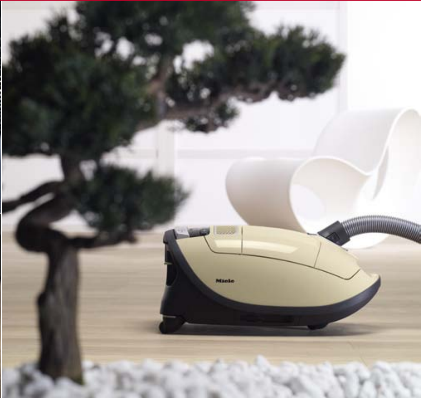
Miele's S8 Alize features a spotlight handle and Dynamic Drive castor wheels.