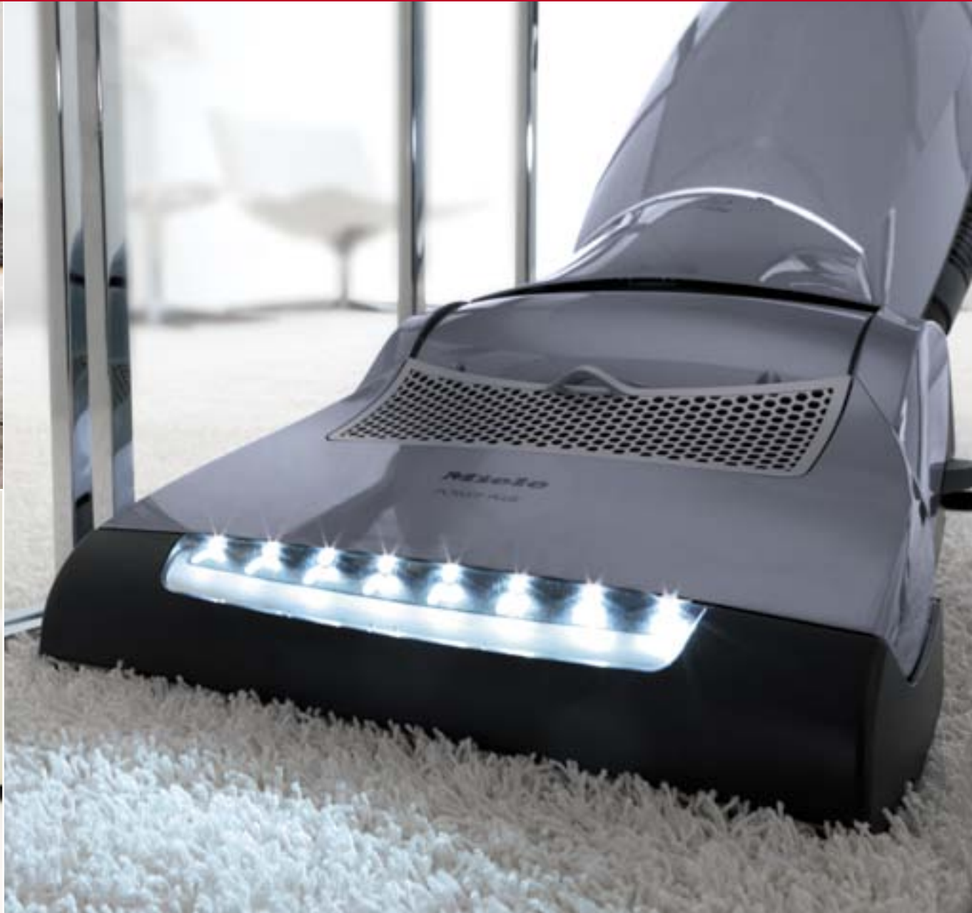
An LED headlight provides maximum visibility as you navigate under and around furnishings.