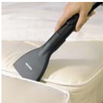
Mattress Tool (SMD 10)

The S7 HomeCare upright encompasses all standard conveniences of Miele's upright series, with the addition of two extra accessories. The specialized Mattress Tool easily cleans between mattresses and bed frames with its wide, flat nozzle. The S7 HomeCare also includes a Universal Brush perfect for dust removal.