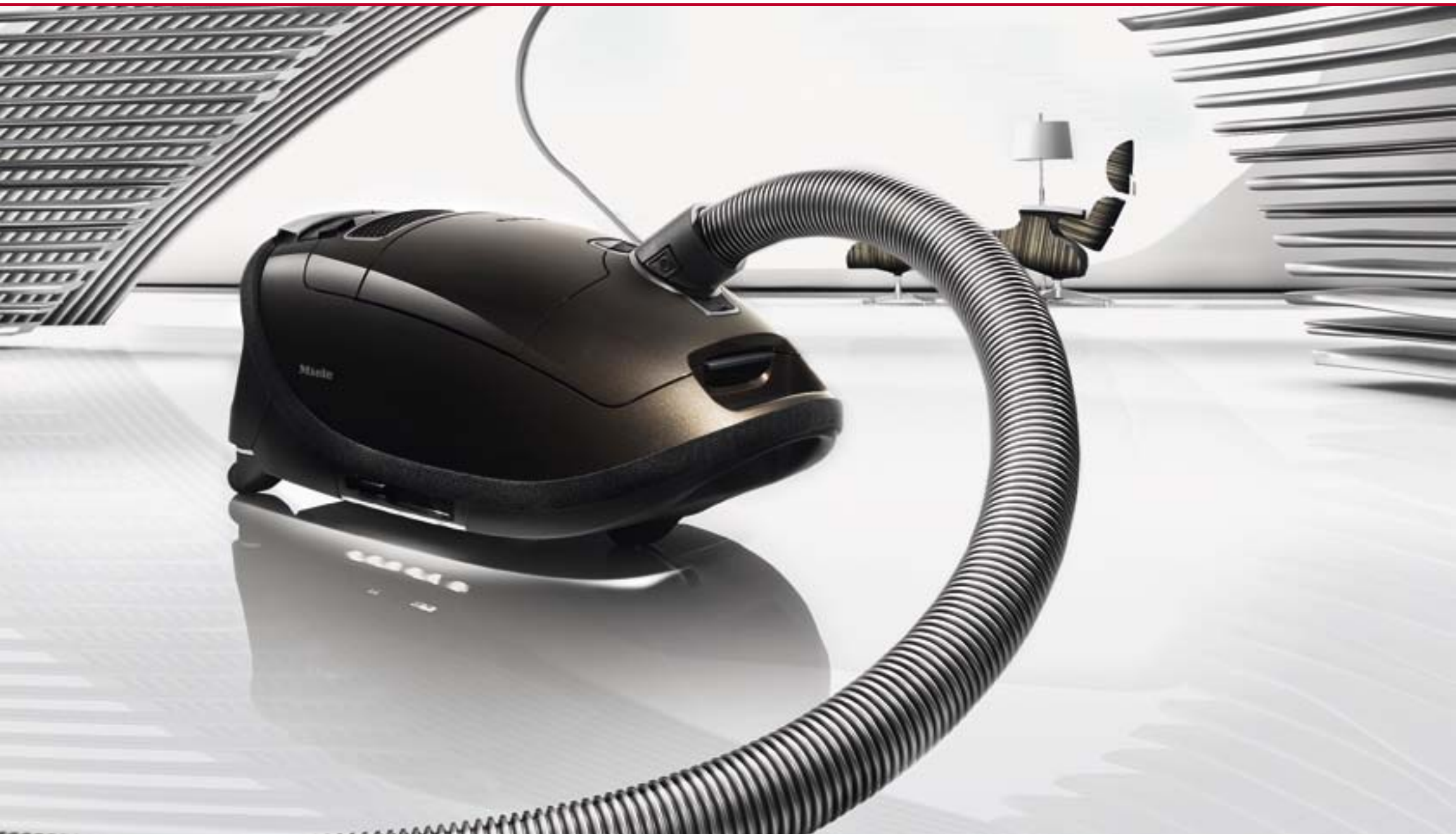
The S8 UniQ