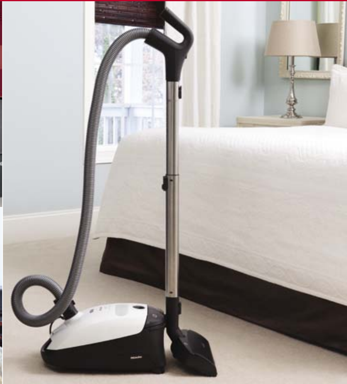
With three covered caster wheels, Miele canister vacuum cleaners pivot easily around furniture and roll over thresholds without scuffing or scratching even your most delicate floors.