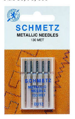
Fig. 5: METALLIC NEEDLE

Developed specially for metal effect thread, with very long eye (2 mm in all needle sizes) in relation to the needle thickness. The eye is even longer than in needle system 130/705 H-E (for embroidering) and remains the same in all needle sizes. The longer eye and the special groove allows the thread to glide easily and gently through the needle (and therefore prevent thread breakage).