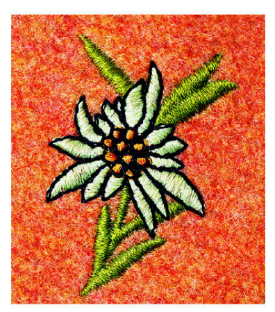
Fig. 4: Detail of Bavarian jacket