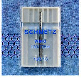
Fig. 10: HEMSTITCH NEEDLE

Application: for decorative seams and hemstitching