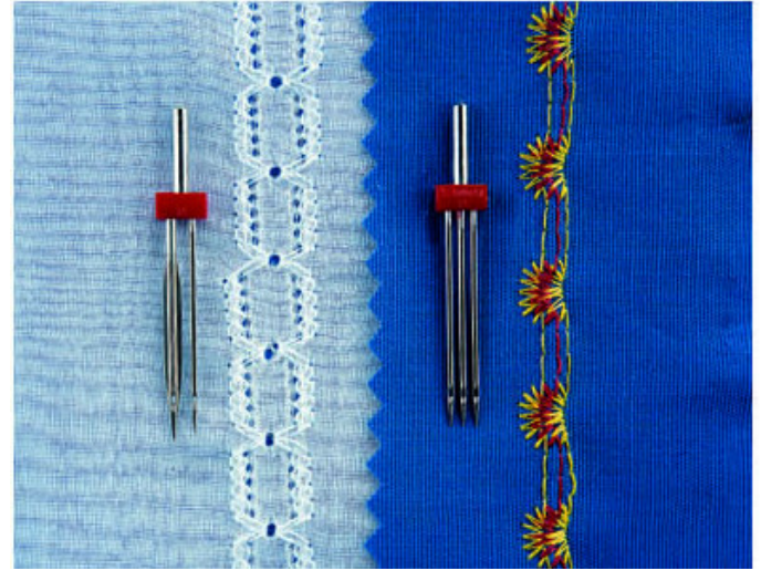
Fig. 11: left: DOUBLE HEMSTITCH NEEDLE, right: TRIPLE NEEDLE

Application: Pintucks, single and multicoloured seams, hems