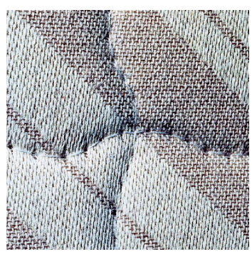
Fig. 12: Detail

In order to carry out a successful work, the needle has to be replaced regularly. Only a damage-free needle point permits to sew in professional quality and avoids thread breakage. In the future, pay more attention to your needle – the high quality and effect of your work will be visible.