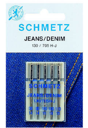
Fig. 7: JEANS NEEDLE

With slim, acute point for easier penetration of thick fabrics and with reinforced blade, which causes less deflection of the needle. The special shape of the scarf reduces the risk of skip stitches.