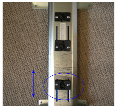
Adjust Plastic Holder move up / down by using Screwdriver