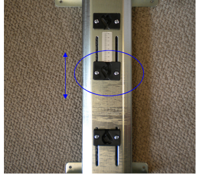
Adjust Plastic Holder move up / down by using Screwdriver

STORAGE POSITION - Adjust platform so your Machine can perfectly sit inside cabinet after door and lid is closed.