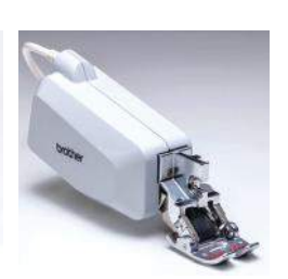
COMPACT MUVIT DUAL FEED FOOT SA209