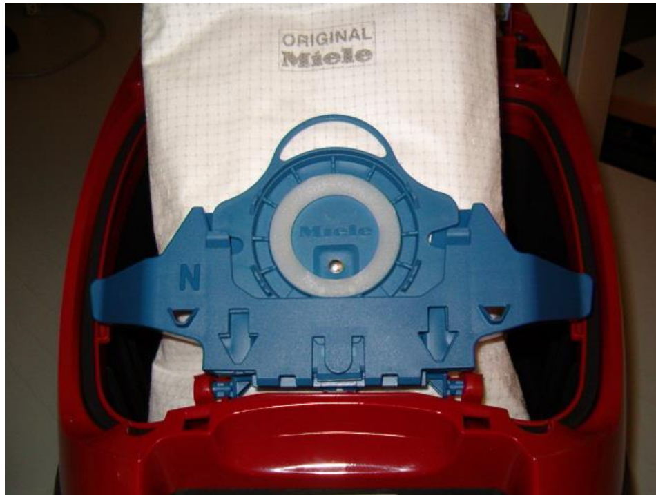
Dust bag properly installed