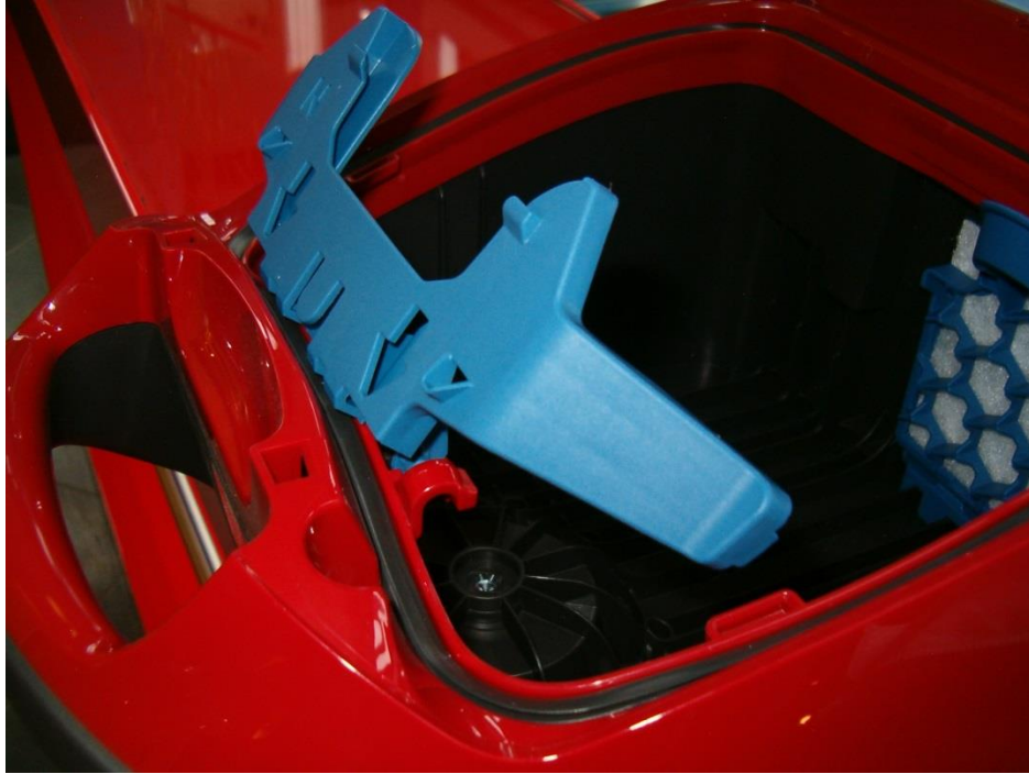
Bag holder properly installed – free to move